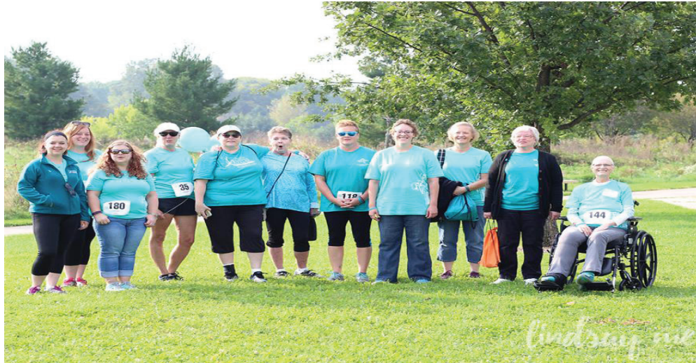
Shown Above: Ovarian Cancer Survivors in attendance at our 2016 WOCA's Whisper Walk