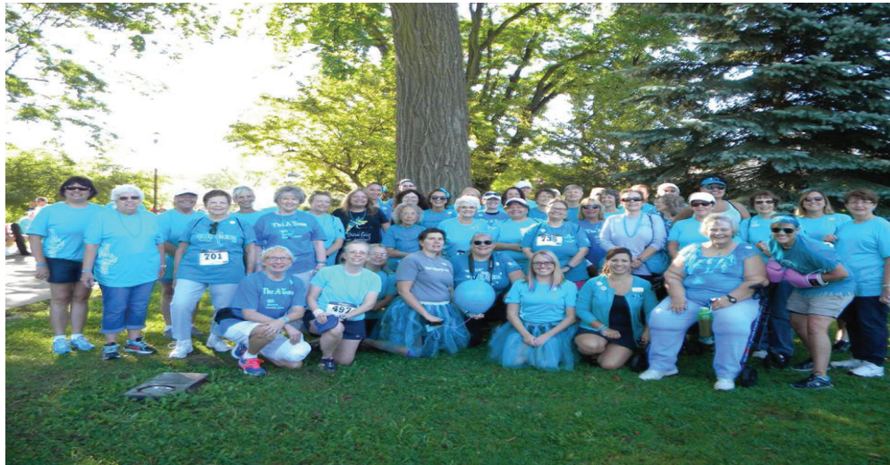
Shown Above: Ovarian Cancer Survivors in attendance at our 2016 WOCA's Nancy's Run, Rock, and Stroll